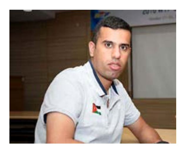
Faris Ali Ibrahim Al Assaf

Best judge in the world for athletic games (people of determination) Assigned as the head of the judging panel at 2008 Beijing Olympics, 2012 London Olympics, 2016 Brazil Olympics, 2011 World Championship in New Zealand, 2013 in France, 2015 in Doha, and 2017 in London, Assigned as main judge in World Cups from 2013 till 2017.